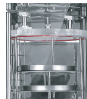
The design of glass door ensures the working situation in the drying chamber visible at a glance