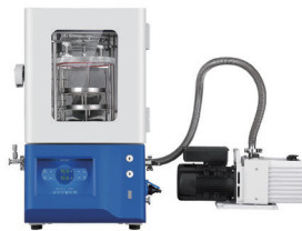
Automatic lifting shelves without manual operation