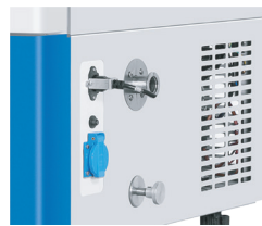
Vacuum pump port, convenient for oil change